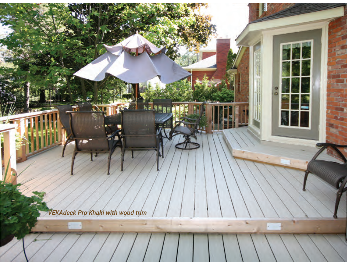
VEKAdeck Pro Khaki with wood trim