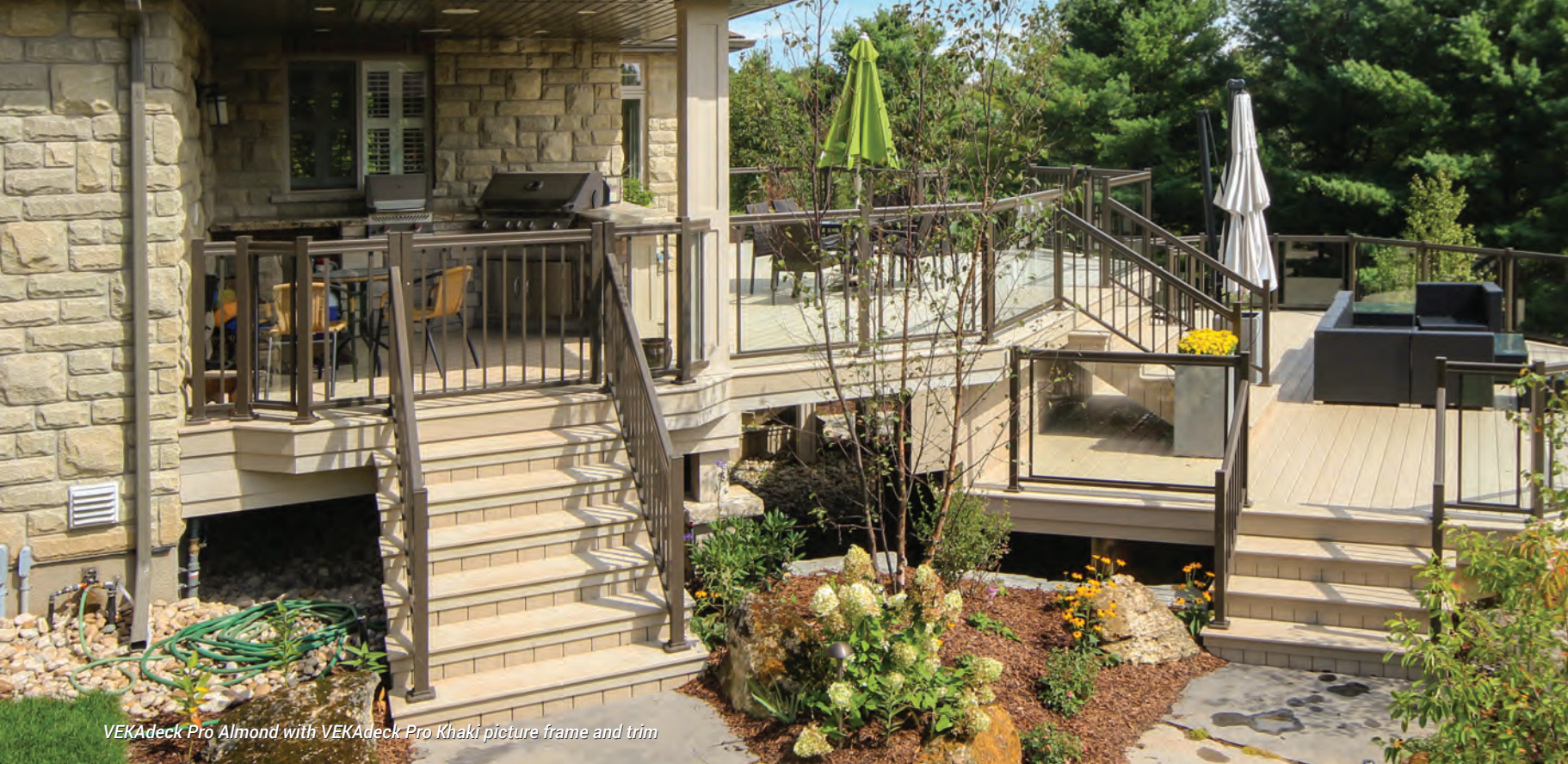
VEKAdeck Pro Almond with VEKAdeck Pro Khaki picture frame and trim