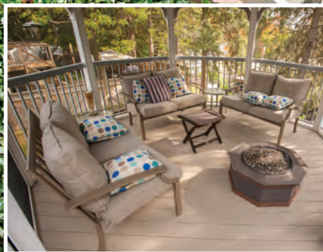
VEKAdeck Pro Almond field with Walnut picture frame, fascia and stair treads