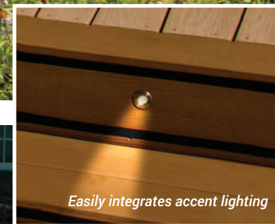
Easily integrates accent lighting