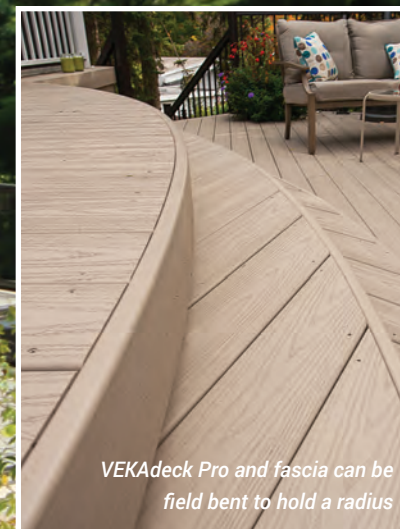
VEKAdeck Pro and fascia can be field bent to hold a radius