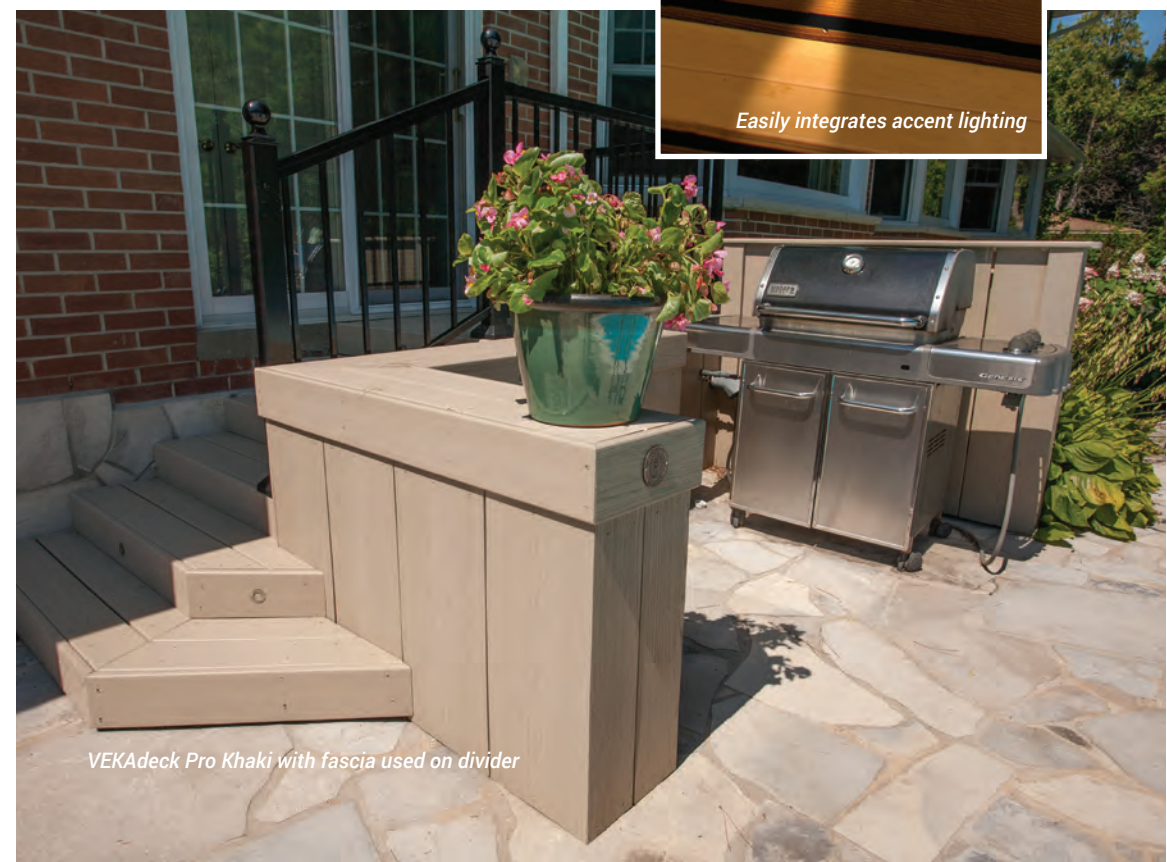
VEKAdeck Pro Khaki with fascia used on divider